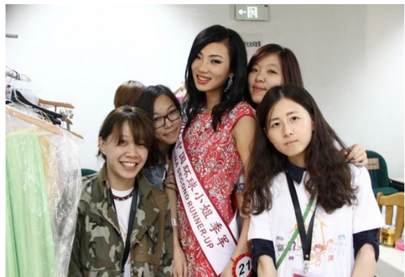
Raffles Design Institute, Shanghai students with the Second Runner-Up Winner of Miss Universe China.