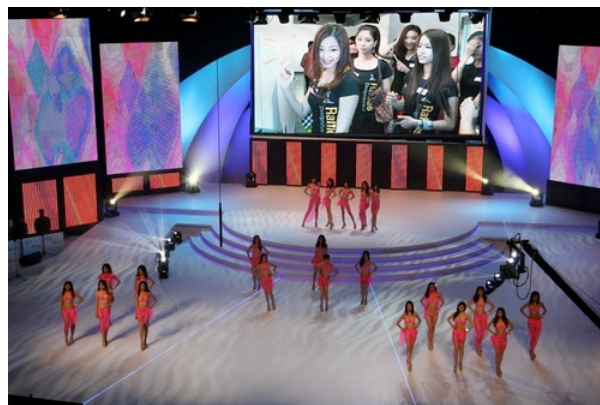
Contestants posing on stage while a video depicting their prior visit to Raffles Design Institute, Shanghai was being played on-screen.